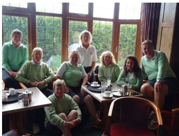
Lady Champions relaxing