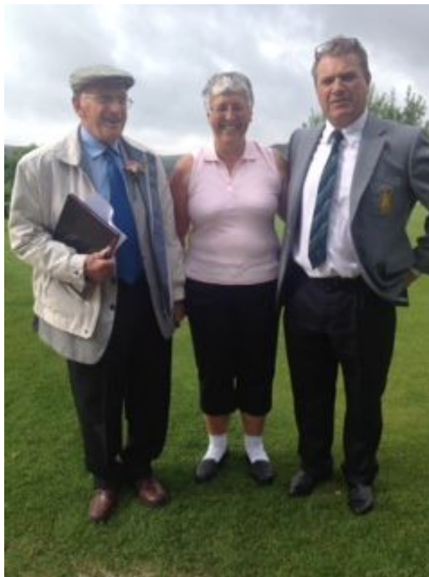
At Starting of Ladies Open