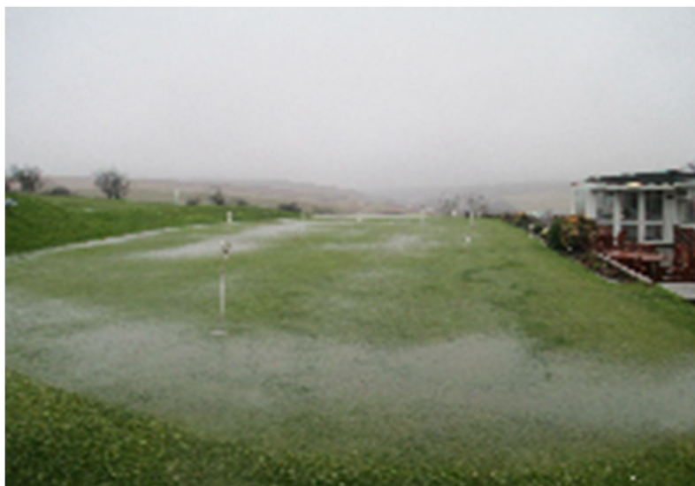
Putting Green – February