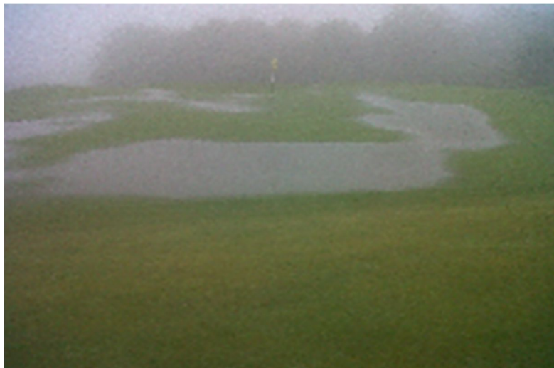
A February scene