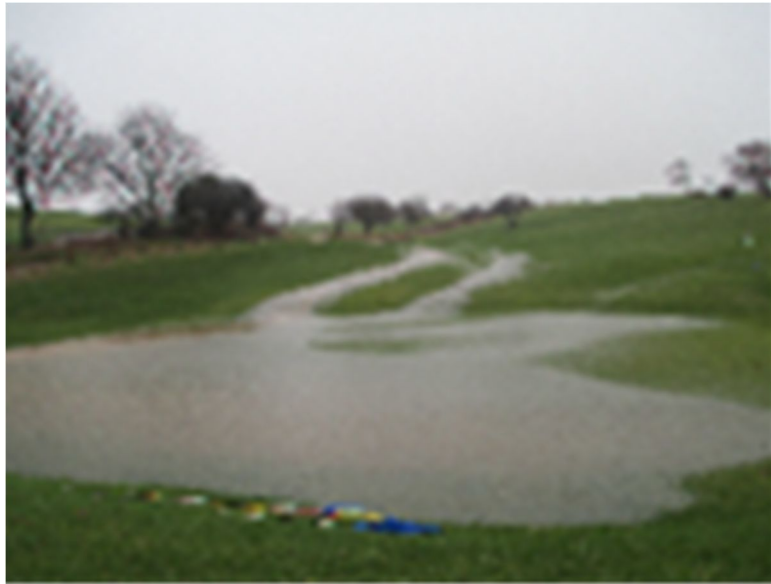
Above: The old 18 th green during some of February's rain